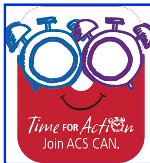
Photo Activity: Use this fun photo prop to take pictures at your meeting, training, or event. Encourage Relayers to take a selfie, post it on Facebook or Twitter using #ACSCAN, then encourage everyone to tag their lawmakers page or handle in their message and encourage them to support cancer research funding. Limited and must be shared between events or reused from stored supply .

ACS CAN Clipboard: Great for use while in the crowd at Relay For Life events. Clipboard provides a surface for Relayers to fill out the ACS CAN membership form and petition. You can store your pens, stickers, cash and completed forms inside the built in storage compartment. Limited and must be shared between events or reused from stored supply .